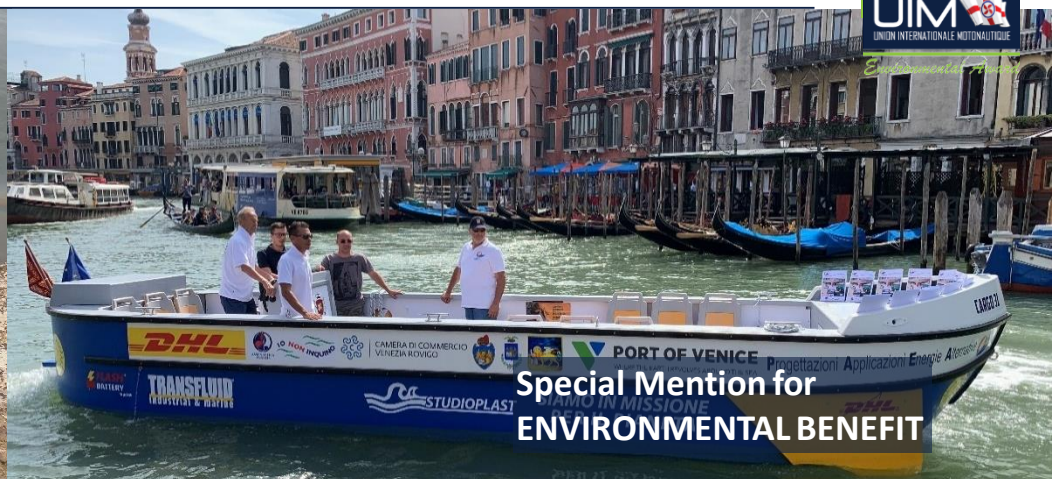
Special Mention for ENVIRONMENTAL BENEFIT